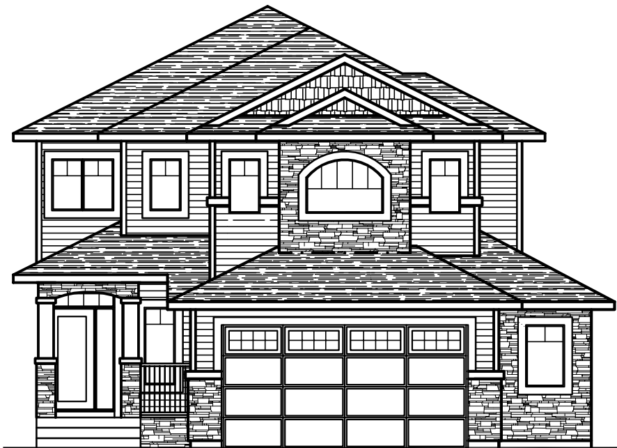
The Rembrandt-2386 sf